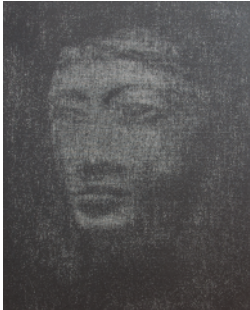
"face" 2017 oil pigment cotton canvas 40x50 cm

Born in Kanagawa in 1980. 2003 Tokyo National University of Fine Arts and Music. 2009, Kinki University International Center for Human Sciences, Yotsuya Art Studium. Lives and works in Berlin. Exhibitions include " moons" Japanisch-Deutsch Zentrum (2015, Berlin), " blue on the ship" Gallery WangHohmann (2014, Wiesbaden) , "Physis 2014" Japanisches-Deutsch Zentrum (2014, Berlin), " THE ECHO - spreading of light" japan foundation (2013, Cologne), " from a distance" Atelier Uberall (2012, Berlin), " Aus aktuellem Anlass" Neue Galerie Landshut e. V. (2011, Landshut), "WE ARE THE ISLANDS" , Kunstraum Bethanien (2010, Berlin), " scene" Gallery Objective Correlative (2009, Tokyo), "SKIP!" Gallery-Stump (2007, Kamakura, Kanagawa).