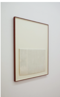
"The Archives (No, Nein, Njet, Non)" 2008 Vintage peace poster, metal frame 67 x 51cm

Educated at London's Royal College of Art. They had been working together from 2003 to 2009 and currently work as individual.