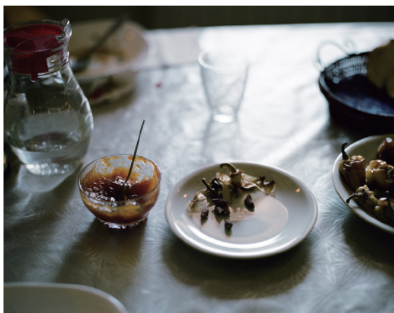
Yuko Amano "Gračanica" 2019, c-print

1-13-6-1F Tokiwa, Koto-ku, Tokyo 135-0006 Japan T/F: +81 (0)3 6300 5881 E: info@hagiwaraprojects.com www.hagiwaraprojects.com